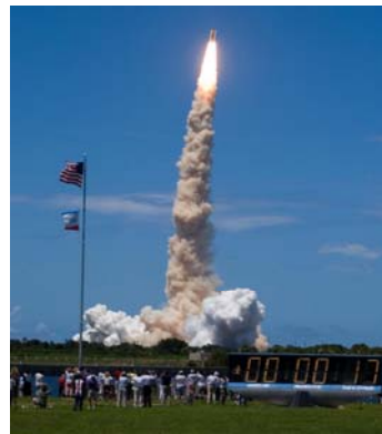
Figure 2: Onlookers view the launch of STS 121.

The ascent phase begins at liftoff and ends at insertion into a circular or elliptical orbit around the Earth. To reach the minimum altitude required to orbit the Earth, the space shuttle must accelerate from zero to 8,000 meters per second (almost 18,000 miles per hour) in eight and a half minutes. It takes a very unique vehicle to accomplish this.