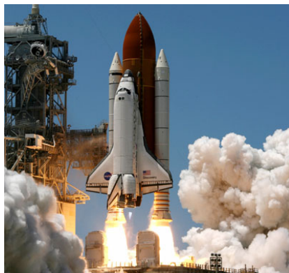
Figure 1: Space Shuttle Discovery at lift-off during STS 121.

Since its first flight in 1981, the space shuttle has been used to extend research, repair satellites, and help with building the International Space Station, or ISS. However, by 2010 NASA plans to retire the space shuttle in favor of a new Crew Exploration Vehicle, or CEV. Until then, space exploration depends on the continued success of space shuttle missions. Critical to any space shuttle mission is the ascent into space.